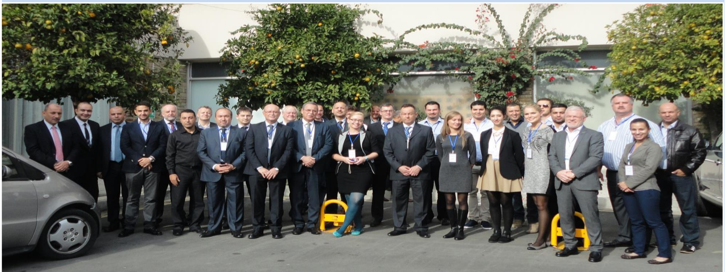
Group Photo: MOIG Regional Workshop, 10-11 December 2014, Nicosia-Cyprus

The report containing the outcome of the workshop is under preparation and will be displayed with presentations on the MOIG Website in mid-January 2015.